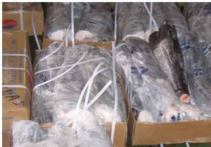
Patagonian toothfish from the South Georgia and South Sandwich Islands MSC-certified fishery, ready for inspection.