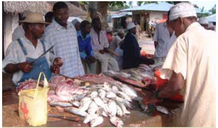
Illegal fishing results in over-exploitation of fish stocks and can have impacts on the availability of fish in local markets.

The deployment of well-trained and motivated fisheries observers can greatly reduce underreporting or at least help to assess the magnitude of the problem. While scientific observers should not be involved directly in an