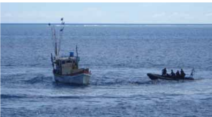
Possible illegal fishing vessel being boarded by fisheries protection officers in the British Indian Ocean Territory.

Regional trends reveal issues related to the quality of fishery management and governance in coastal states. For example in the Eastern Central Atlantic there appears to