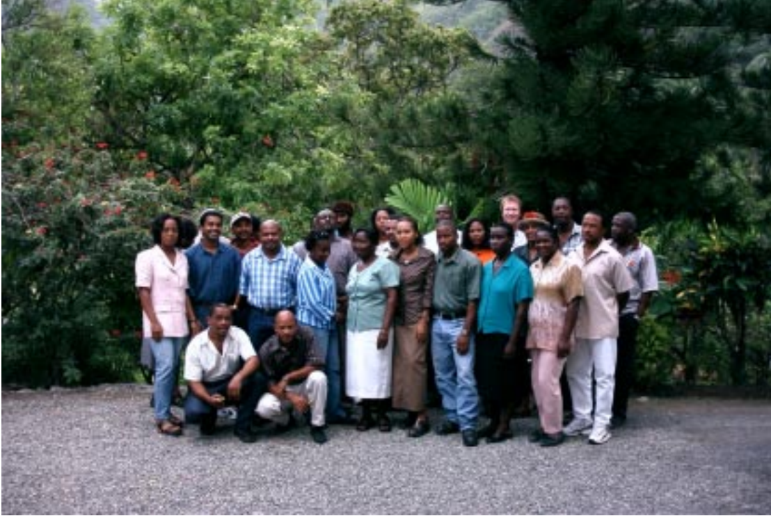
Participants at the workshop, Still Plantation, Soufriere, 26 June 2001