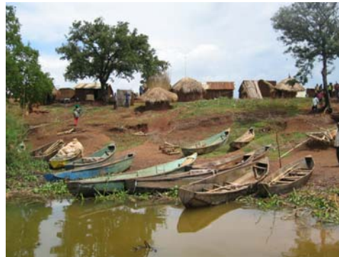
'A person falls sick until he dies if he or she does not have friends'. (Lake Albert)